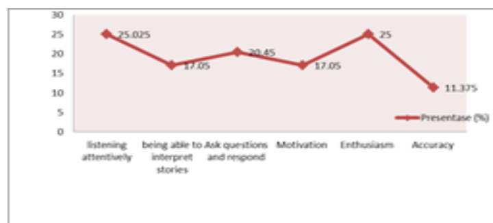
Figure 2. Result of Listening Skill and Creativity of Students

the activities. However, there were still three children who could not carry out activities with good result until the end of the activity due to the difficulty of the children to concentrate. In less criteria (K), it appears that students who have not been able to sit quietly are moved to another group so that the teacher invites students to be active in telling stories about their 'experience of going to the market'. More students are asked to focus more because there are still some who have not been able to show the ability to listen attentively, interpret, and understand meaning (Pebriana & Fantiro, 2017; Budyawati & Hartanto, 2017). Thus, lesson study based- activities are quite effective in improving early childhood listening skills, although there are several obstacles. Of course, children are able to bring up behaviors that reflect listening ability even though their abilities have not been consistent and have not been shown by all children. In the activities, children often talk about various things by listening to information with their teacher and friends in class. In addition, some children reminded each other when they took actions that did not want to communicate well with the teacher. The following are the result of listening ability.