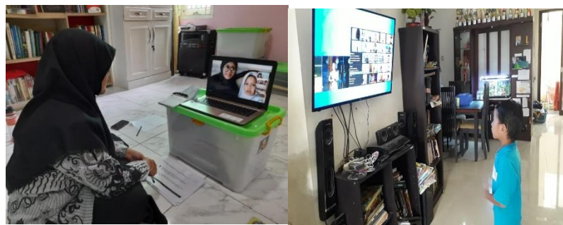
Picture 2. Process to understanding the growth and development of children

Professional competence is related to the mastery of teachers on early childhood development material as a substance, including physical-motor development, language, social-emotional, moral religion, and art. Distance learning program influences the mastery of aspects of professional competence on the ability to make learning plans that are in accordance with the STPPA (Child Development Achievement Level Standards). STPPA is a part of Indonesian National Curriculum of early childhood education. Most of the teachers (24 teachers) have adjusted their distance learning plans according to the STPPA, one teacher said that it was not appropriate and five others were still in doubt. This was achieved because it was supported by the ability of teachers to understand the level of achievement of good child development.