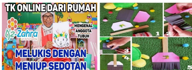
Picture 3. Process to understanding the provision of educational stimulations, protection, and care.

The results of research related to understanding the provision of educational stimulations, protection, and care that of teacher data analysis (27 people) can explain well that the learning plan must be arranged according to the stages of age so that the stimulation provided is in accordance with the child's ability. This is done so that children can get the right portion so that their development can run optimally. Only a small portion (3) teachers who have not been able to explain it correctly.